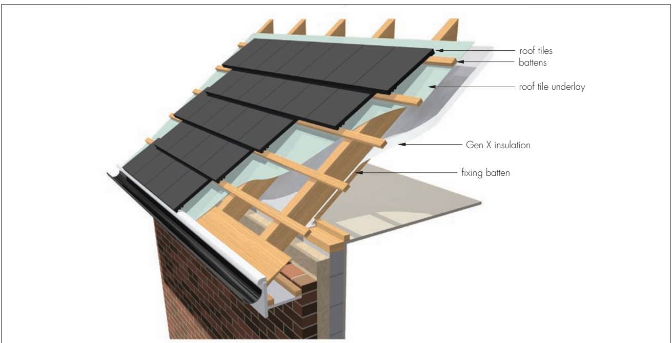
Figure 2 Installing Gen X below rafters

14.14 Any exposed cut edges of the product should be sealed with a suitable adhesive tape. Any tears or holes in the outer layer should be repaired with Gen X tape.